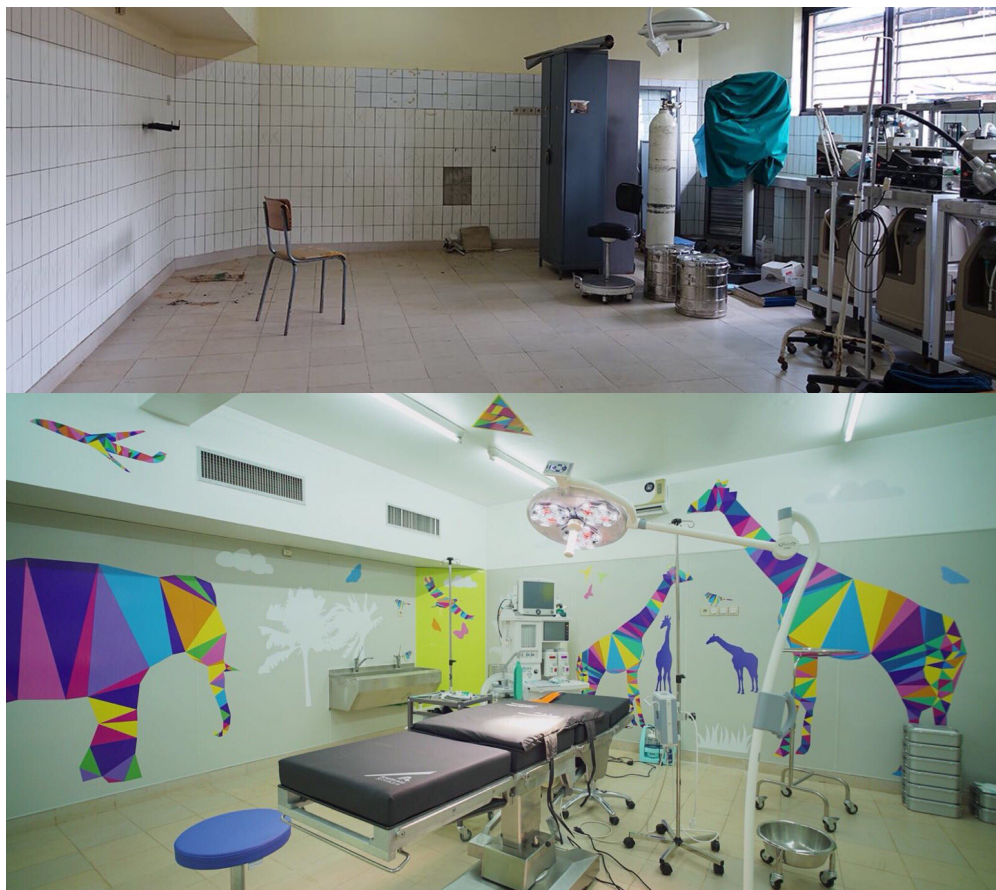
Before and after pictures in Kigali, Rwanda